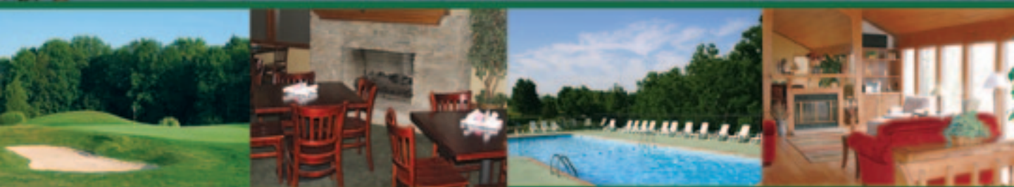
Championship Golf Course