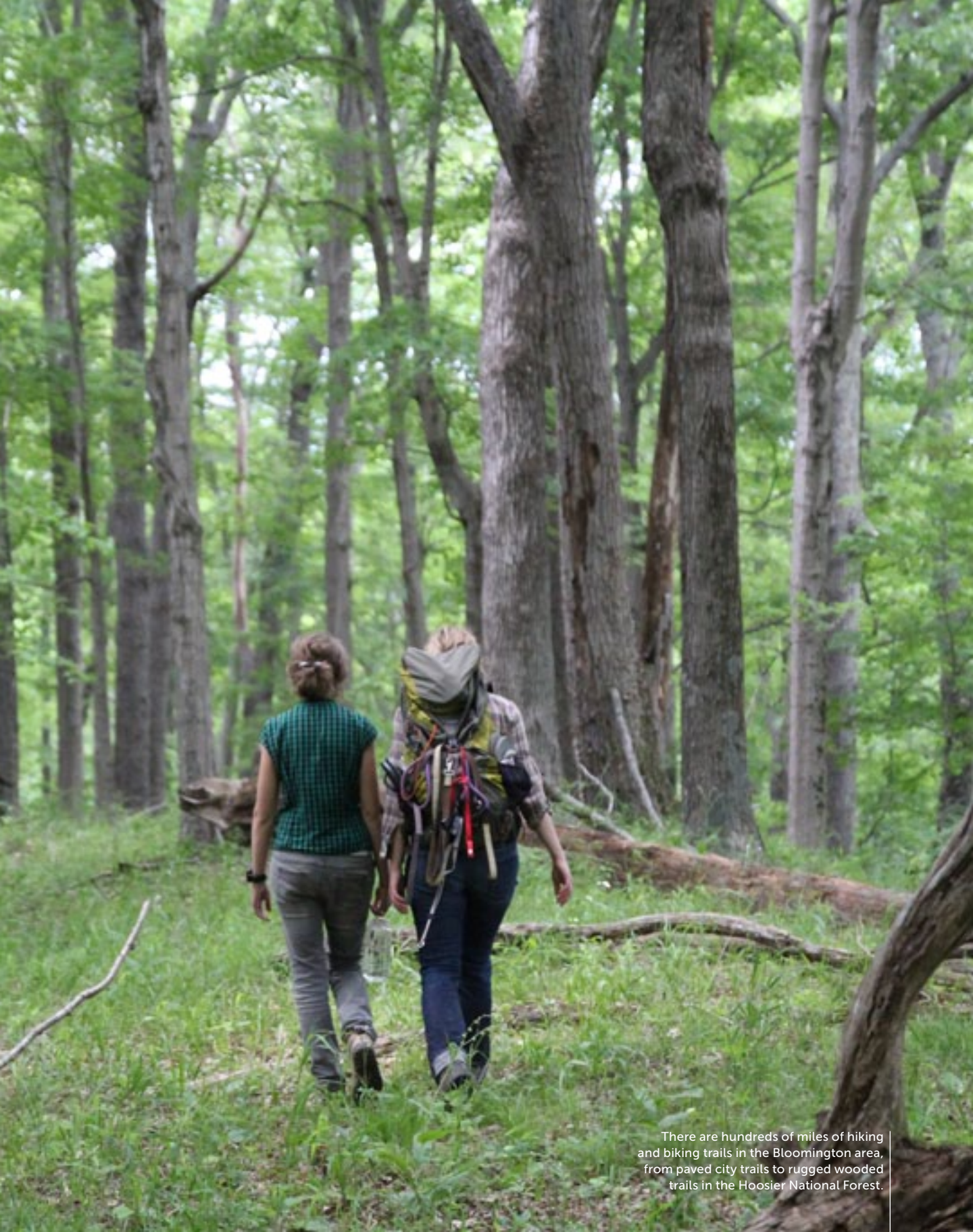
There are hundreds of miles of hiking and biking trails in the Bloomington area, from paved city trails to rugged wooded trails in the Hoosier National Forest.

ONE OF THE MOST AMAZING THINGS about Bloomington and the surrounding area is the profound natural beauty. Even within the city limits there are plenty of opportunities to commune with nature, like Wapehani bike park or the Rail Trail. The efforts of the community to keep Bloomington covered in a lush green canopy of trees ensure that all areas of the city remain beautiful.